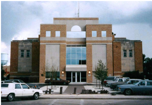
West Elevation – 1992