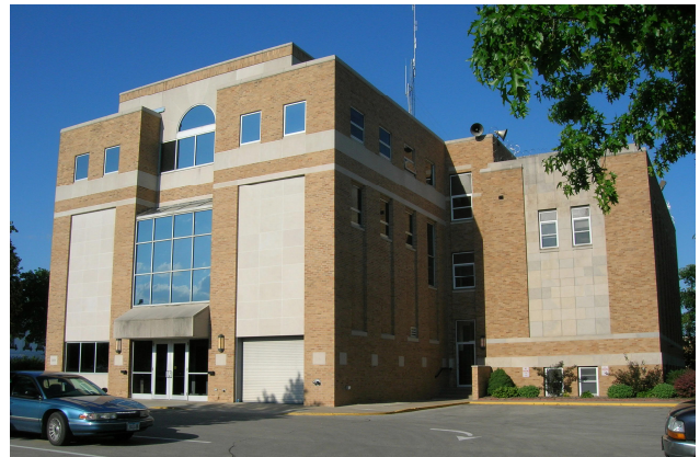
View from Southwest – 2008