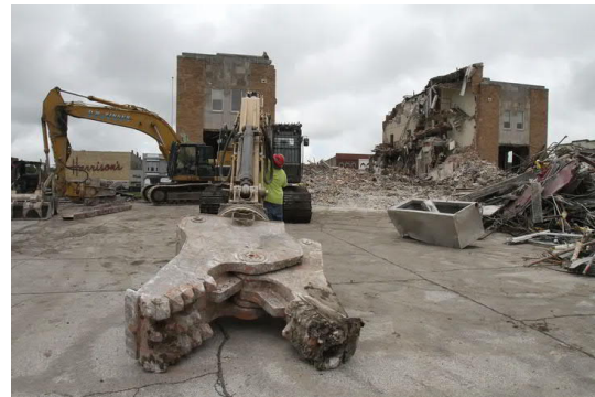
Demolition – 2019

KCCI Report, Down It Goes - https://www.kcci.com/article/down-it-goes-crumbling-warren-county-courthouse-demolished/27677213