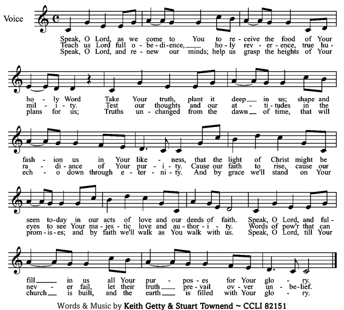
Speak, O Lord